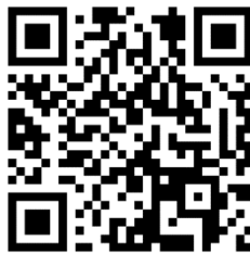
New Church Ministry